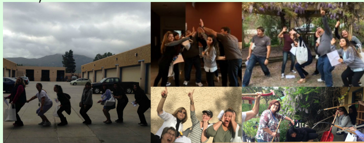
Going The Extra Mile