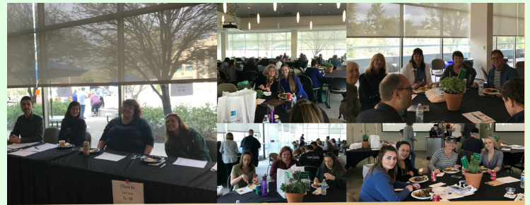
Going The Extra Mile