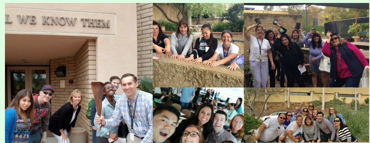
Going The Extra Mile